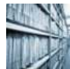
Archives, storage vaults