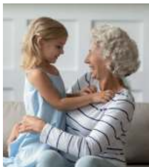
In schools and nursing homes

The early and most reliable detection ensures the highest safety standards. Orderly and fast evacuation is secured thanks to clear voice messages with a wide range of languages to choose from which is particularly convenient in hotels with international clientele.