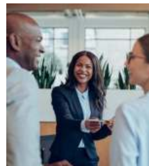
In hotels and homes