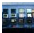
Control rooms, technical rooms