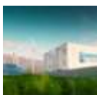
Li-ion storage systems