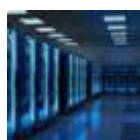
IT and server rooms