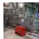
Closed transformers, generators