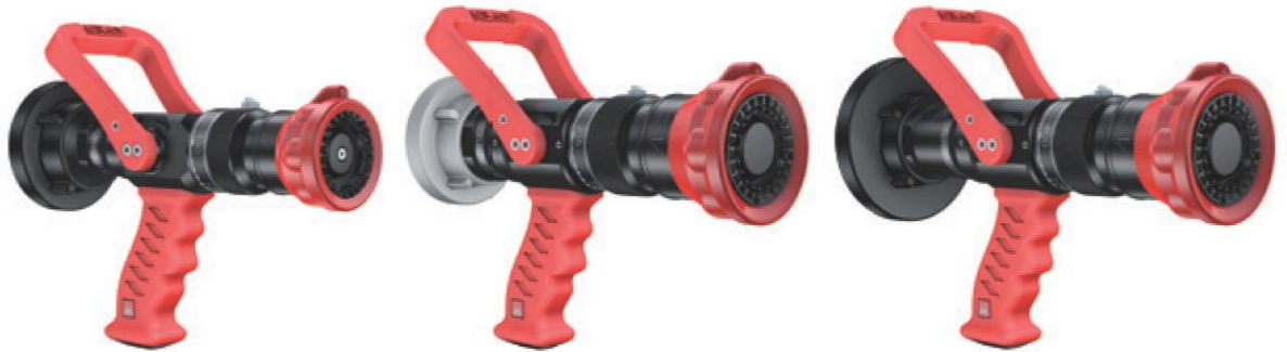
2400 EN B