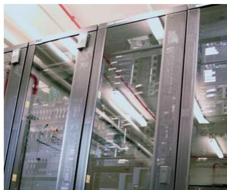
Internet PoP, Hanover, Germany