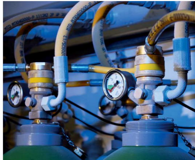
Depending on the application, nitrogen, argon or carbon dioxide is the optimal extinguishing agent.