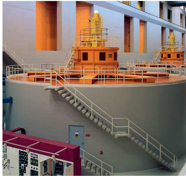
Sinorix extinguishing solutions with natural gases can be tailored to existing building structures and requirements.